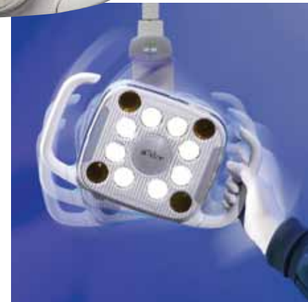
A-dec LED's three-axis, spherical rotation makes every movement fluid and ultra-precise.

Low Power, No Bulbs, Low Heat, No Noise. When it comes to cost of ownership, think low —and ecologically smart: the A-dec LED consumes 80% less power than halogen lights, with a life expectancy of 20 years. All without ever having to change a bulb. And because it doesn't emit heat or require a fan for cooling, it's both comfortable and quiet.