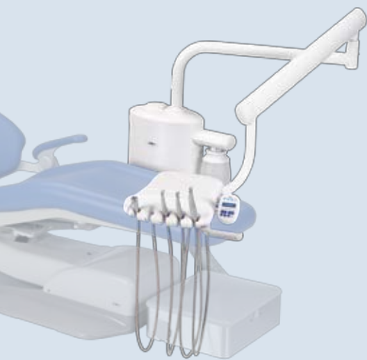
Decade chair with A-dec 300 support center and A-dec 300 traditional delivery system.

Looking to upgrade your operator, but want to keep your existing chair? The A-dec 300 support center and traditional delivery system can attach to your existing chair to easily infuse A-dec 300 integration into your treatment room.