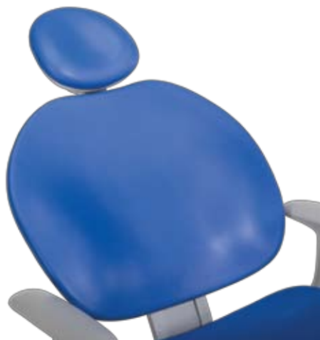
Thin-line back with double-articulating headrest

The A-dec 300 chair features a thin-line back with your choice of double-articulating headrest or patient-adjustable neck support.