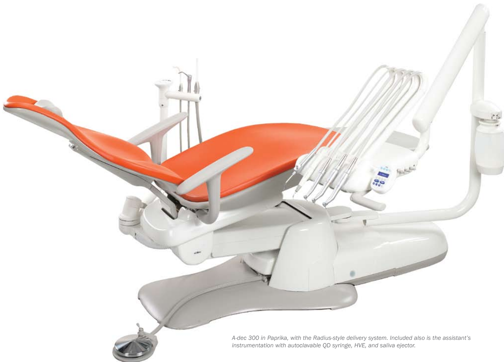
A-dec 300 in Paprika, with the Radius-style delivery system. Included also is the assistant's instrumentation with autoclavable QD syringe, HVE, and saliva ejector.