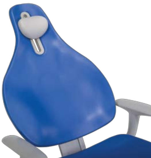
Thin-line back with patient-adjustable neck support