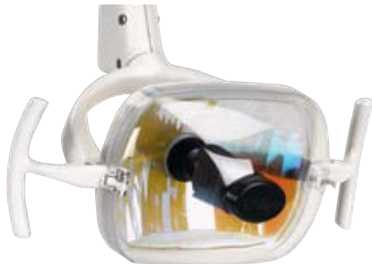
A-dec 500 light