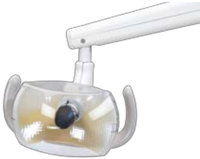
A-dec 300 light

Get horizontal and vertical rotation, and two intensity settings with the A-dec 300 light. Or, choose the A-dec 500® light with a third axis of rotation and three intensity settings.