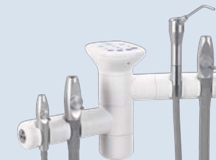
Dual 2-position holder (international only)